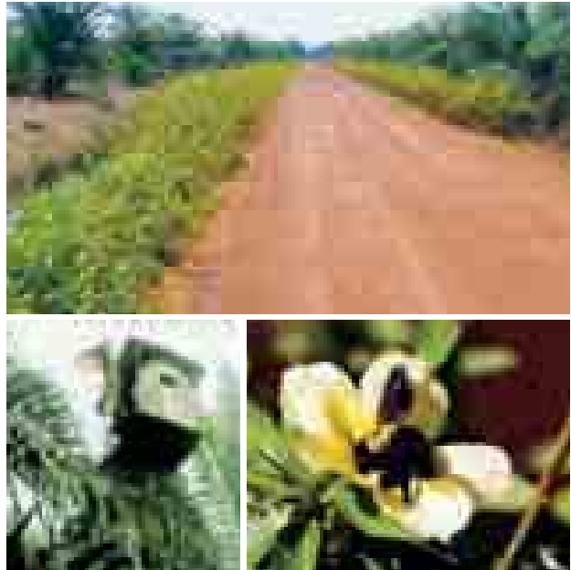
Planting of beneficial plants and the use of barn owls as part of integrated pest management

Oil mills are no exception. All six of our Group's mills have been certified for Code of Good Milling Practice by MPOB. Further independent verification of our adherence to best