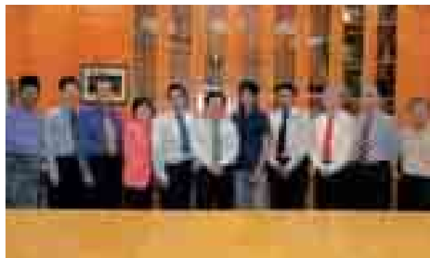
Engagement with UPM Agriculture Faculty and scholarship recipients

Over and above all, we recognise that effecting sustainable progress in society must begin at the grassroots level. To achieve this, there is no single factor that is more fundamental than education. Fittingly, therefore, our Group has put education at the forefront of our social engagement agenda.