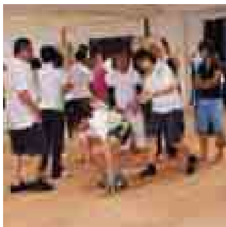
Company trips are organised annually to enhance interaction among employees