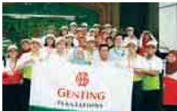
Our team for Kuala Lumpur Rat Race 2011

Philanthropic giving, an effective means for corporations to respond to the urgent needs of the underprivileged, remains very much a fixture in our social responsibility programme. The charitable causes we supported financially in 2011 included, among others, relief for the victims of the Johor floods and for the 5th consecutive year, the annual Edge-Bursa Malaysia Kuala Lumpur Rat Race.