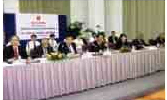
Genting Plantations Berhad's Annual General Meeting 2011

As serving the best interests of all stakeholders goes hand-in-hand with maintaining integrity in all our dealings, our Group enforces strict policies to ensure that all business affairs are conducted above board, in a professional and trustworthy manner, free of any form of corruption or unethical behaviour. This ethical code applies across the many facets of our business activities, encompassing our relationships with our partners, vendors, contractors, customers, governing authorities and anyone else we work with.