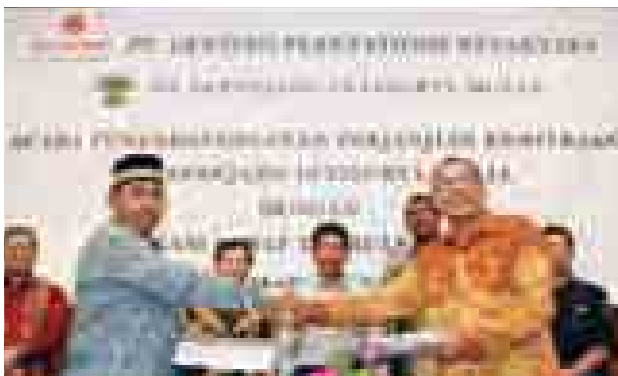
Signing ceremony of the first plasma programme under SIS Mulia on 29 July 2011

In Indonesia, our Group has taken another stride forward in fulfilling our responsibility to the well-being of the local community with the establishment in mid-2011 of the first Plasma programme under the SIS Mulia development in Kabupaten Ketapang, West Kalimantan. The signing of the agreement for the Plasma co-operation, which involves the development of new oil palm plantations for small landholders to operate, undoubtedly paves the way for the further deepening of ties.