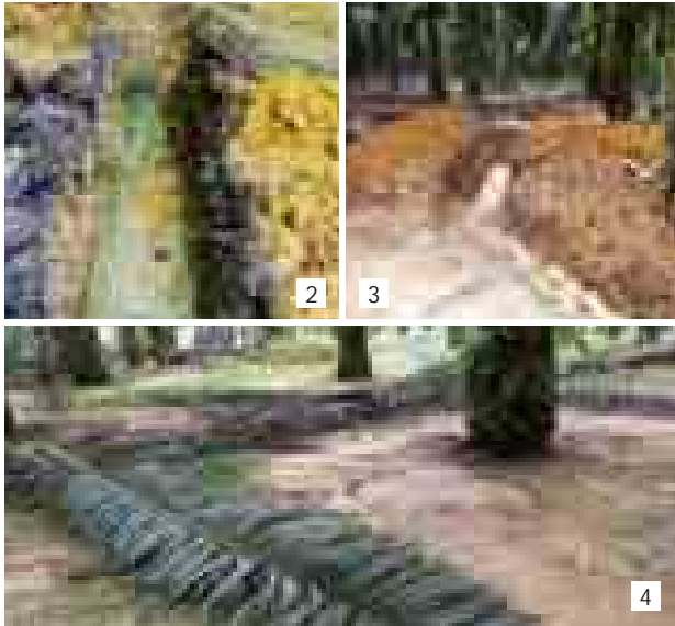
2-3. Construction of water conservation trenches and silt pit to reduce soil erosion 4. Stacking fronds in T-shape to reduce fertiliser run-off