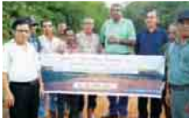
Hand-over ceremony upon completion of road repair works by the Group to local villagers at Mulia Estates

In many ways, our Group is well-positioned to contribute constructively to rural development. For the communities in the often-isolated areas where we operate, our presence provides a chance for them earn a livelihood through the variety of employment and business opportunities on offer. Accessibility and connectivity in these rural areas are noticeably improved by virtue of the infrastructure and amenities established by our Group, including roads and bridges as well as ferry and speedboat services.