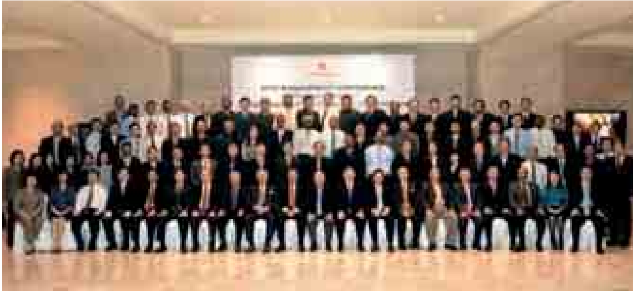
Participants at the 30th Management Conference

crèche facilities, places of worship, sports facilities and other amenities at our estates and oil mills.