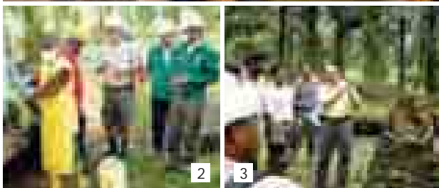
1-3. On-site training programmes are regularly conducted