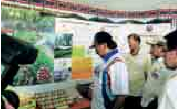
Joint participation with Department of Agriculture, Sabah at Hari Peladang, Penternak dan Nelayan 2011 - YAB Seri Panglima Musa Haji Aman, Chief Minister, Sabah at the booth

Professional development aside, the personal well-being of our people is also regarded as deserving of at least as much attention. Promoting work-life balance is essential in shaping employees who are continually happy, motivated and productive. Our Group organises recreational activities such as staff trips, friendly sports tournaments and festival celebrations on a regular basis to encourage healthy living and instill a greater sense of camaraderie among employees.