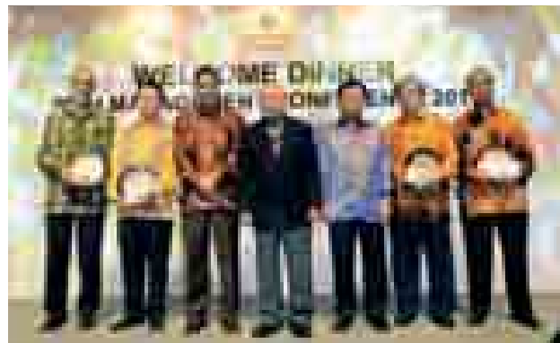
Recipients of the various outstanding performance awards

We also seek to lay down well-defined career advancement paths that are optimally suited to the unique individual skill-sets of every employee, thus empowering them to realise their full potential with our Group for our mutual benefit.