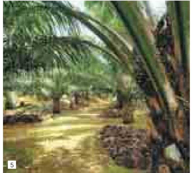
5. Organic mulching to reduce use of fertilisers

These short-to medium-term HCV management strategies cover, among others, the responsibility of estate management teams in ensuring that agricultural practices and operations do not adversely affect the environment and biodiversity within and surrounding our estates. Signboards prohibiting illegal hunting, poaching and felling of trees were installed at HCV areas and estate entrances, on top of regular security patrols to prevent encroachment by outsiders. Training and briefings were conducted for estate management teams, staff, workers and contractors to impress on them the importance of conserving HCV areas. References for effective landscape planning and cultivation have also been provided in the HCV management plan.