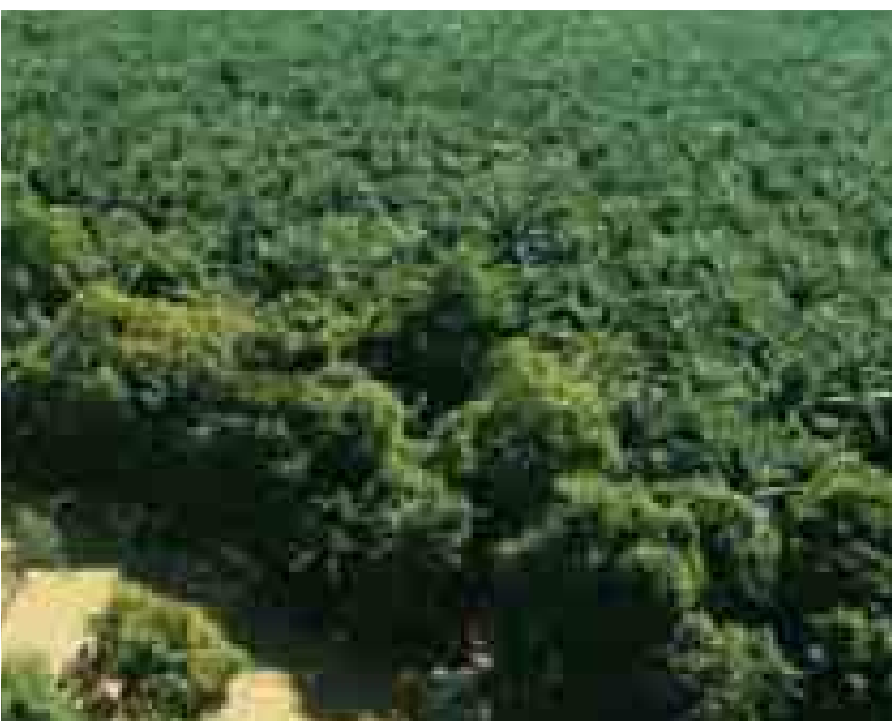
Reforestation initiatives along Tenegang Besar River

We recognise that while corporations have the resources and responsibility to take the lead in driving any environmental sustainability action, it is ultimately the support of employee that will determine its success. Therefore, to cultivate greater employee awareness towards environmental care, our Group has embarked on an initiative to promote the efficient use of resources and to reduce wastage in the corporate offices. As a start, a recycling programme has been implemented, with colour-coded bins for waste segregation prominently displayed. More green programmes are set to be introduced progressively.