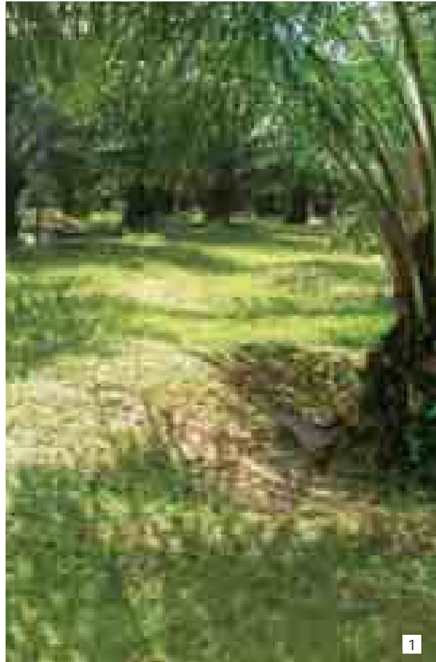
Among the good agriculture practices adopted by our Group 1. Good field upkeep with retention of light grass

In 2011, we advanced further in our ongoing sustainability journey as we continued to inculcate and strengthen "green" practices across our plantation and oil mill activities.