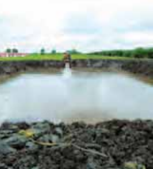
Water management using flood gates (left) and perimeter bunding with retention pond (right)

pose an imminent or undue threat to the environment. Nevertheless, our Group constantly looks to minimise agrochemical use in our plantation operations by applying organic substitutes where available, not just for environmental risk mitigation reasons, but also for the resultant cost-savings.