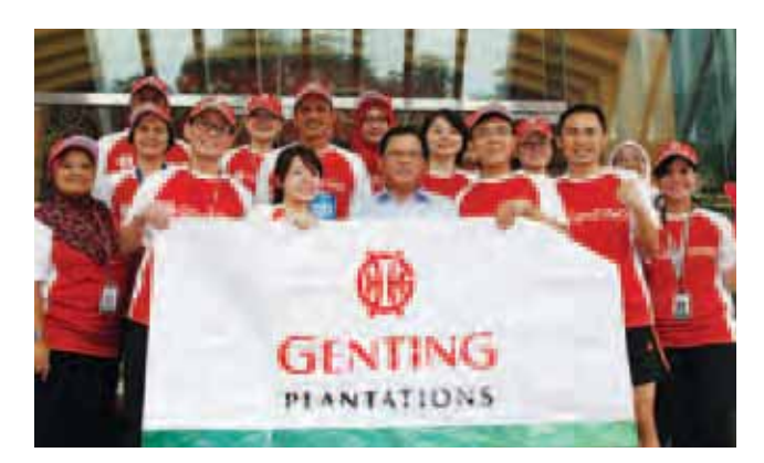
Participants of Bursa Malaysia's annual charity run