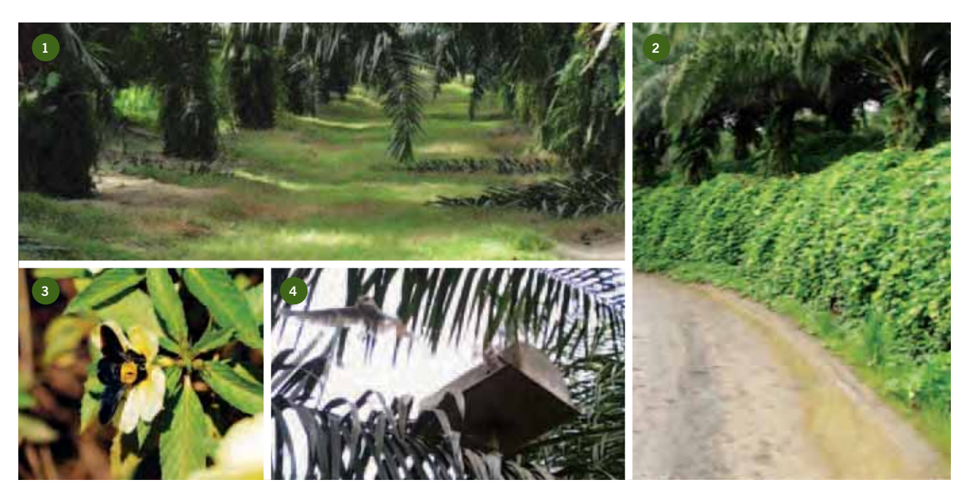
Among the good agricultural practices adopted by our Group 1 & 2. Good establishment of soft grasses and cover crops to reduce soil erosion 3 & 4. Integrated pest management to reduce use of pesticides

As a grower that is still in an expansionary phase, our Group requires a certification scheme that is conducive to achieving an equilibrium between meeting the development milestones of our business on one hand and upholding environmental, ethical and social considerations on the other. The ISCC system is thus deemed suitable as it is one of the most progressive set of sustainability standards covering aspects such as reduction of GHG emissions, sustainable use of land, protection of biodiversity and social accountability.