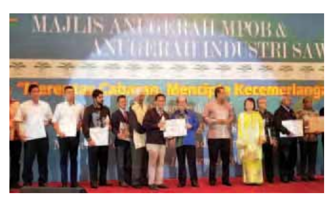
Genting Indah Oil Mill won the Malaysian Palm Oil Industry Awards 2013/2014 - Highest OER category

Our Group's commitment to the highest standards of OSH practice led to one of our estates winning the National OSH Excellence Award 2014 for the plantation category. This annual award represents the highest recognition by the Malaysian government for organizations that have demonstrated outstanding performance in the implementation of safety management systems. The certification of our Group's oil mills in Malaysia to the leading OSH standards, namely OSHAS 18001:2007 and MS 1722:2011, also demonstrate our adherence to the best practices in workplace safety.