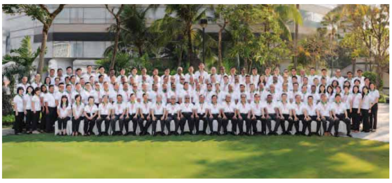
Participants at the 33rd Management Conference

Employees are encouraged to participate in professionally-conducted training courses to enhance their competencies and deepen their knowledge of their respective specialisations. At the operating unit level, a variety of capacity-building and technical training courses are regularly held for managers and staff. Potential field supervisors have the opportunity undergo a structured training programme designed to develop their skills and competencies.