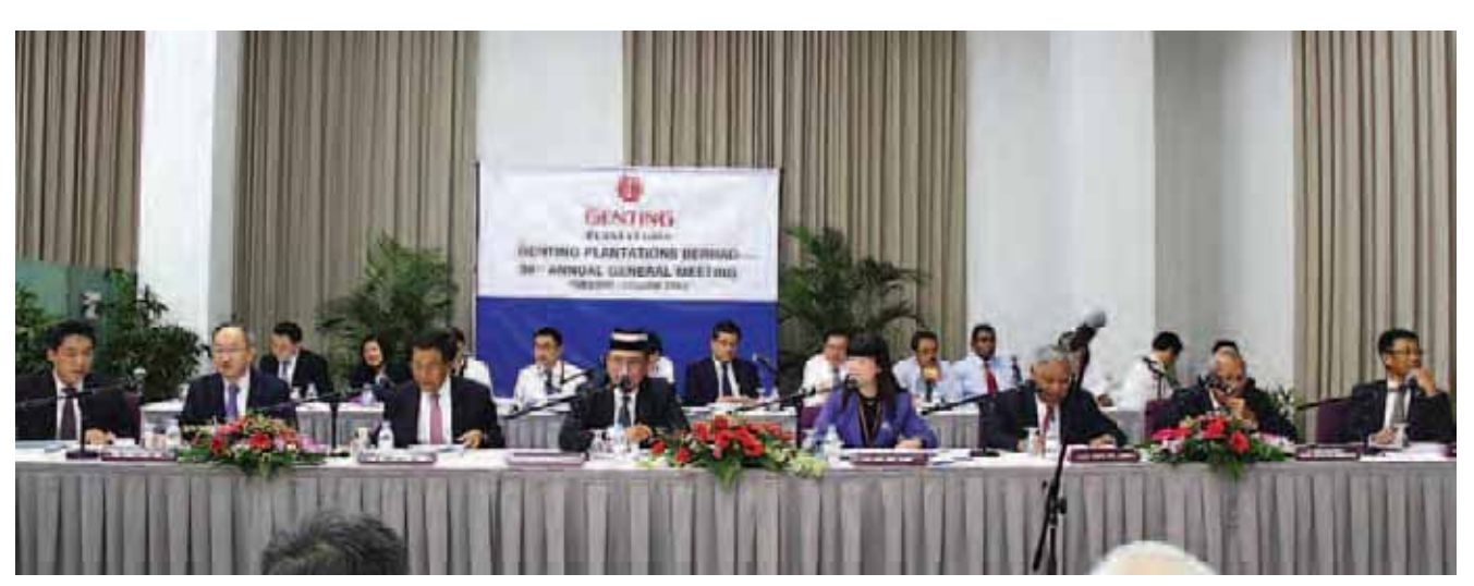
Genting Plantations Berhad's Annual General Meeting 2014

Our Group is also providing internship opportunities to TARUC's undergraduates to experience the working environment of oil palm plantation. The qualified graduates will undergo our inhouse structured training known as Genting Talent Resource Program ("GTRP") which produces trained and competent personnel in oil palm plantation management. The MOU is also opening doors to collaboration in terms of R&D, training and the sharing of resources. It is hoped that with such collaboration, we will continue to attract young talents with the relevant knowledge and interest in the business as these initiatives will address the shortage of human resources in the plantation sector besides meeting the requirement for the further expansion of our Group.