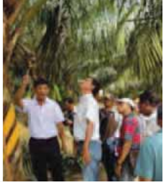
Training sessions are continuosly conducted to enhance competencies