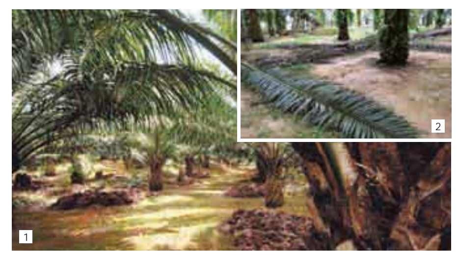
1-2. Recycling of palm fronds and empty fruit bunches to supply nutrients to the soil

developments in the RSPO, especially those related to new planting procedures, were also provided to the operating units.