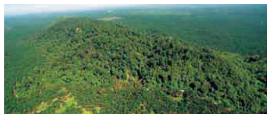
Forest conservation initiative, Genting Bahagia Estate

When it comes to plantation development and expansion, we take a careful and meticulous approach to avoid any encroachment into HCV forests and riparian buffer zones. Areas verified as being rich in biodiversity are duly preserved in their natural state, as manifested, for instance, by the setting aside of the Baha and Bahagia wildlife sanctuaries in the Genting Tenegang Group of Estates in Sabah and the protection of HCV forests in our Group's new plantation projects in Kalimantan, Indonesia. In the establishment of new oil mills environmental safeguards and other innovative green features are incorporated. Genting Indah Oil Mill, which was commissioned in 2009, incorporates environment-friendly technologies that