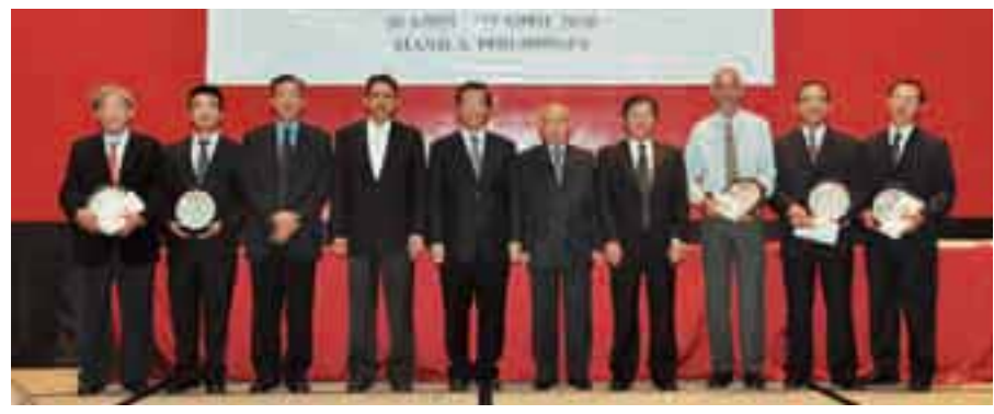
Recipients of the various outstanding performance awards

We take a keen interest in the welfare of our people. Our Group routinely organises recreational activities like staff trips and