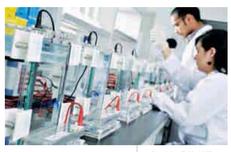
Applying genomics-based solutions for a better future

Furthermore, ACGT is also studying the ganoderma, a white rot fungus which causes basal stem rot, one of the most threatening diseases in oil palm. ACGT is studying the ganoderma genome to develop early detection, treatment and prevention solutions for oil palm plantations. With a ganoderma detection tool, plantations are able to diagnose the presence of ganoderma and the severity of the infection at an early stage.